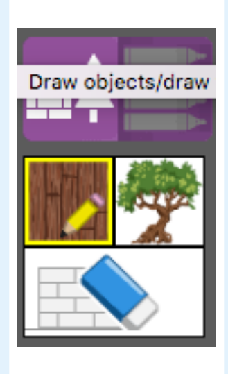
Add images to your game