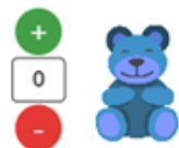
Add or delete objects from the Pictogram